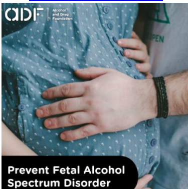
Static image 2